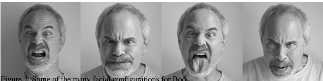
Figure 2: Some of the many facial configurations for Boo.

A third school of thought is rooted in psychological construction (sometimes mislabeled as "other-dimensional" approaches). The ghostly mind is said to contain basic ingredients that combine and interact in complex ways to produce supernatural phenomena, including emotions. Identifying those ingredients is an area of active research, but current hypotheses include light, soul, and swamp gas. In a construction mindset, an emotion such as "Boo" is not a uniform essence (e.g., a "supernatural kind") but a broad category with great variety (Fig. 2).