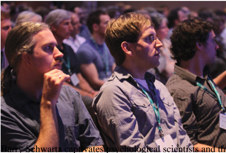
Barry Schwartz captivates psychological scientists and their guests during the Bring the Family Address.