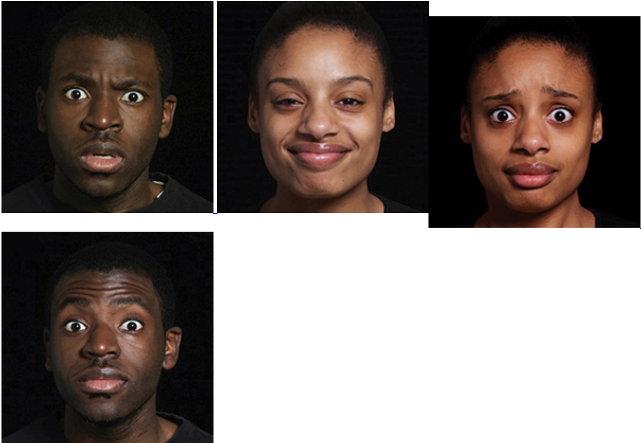
Figure 1. Ask students different questions about these photos to demonstrate how methods shape results.

photo, please answer the question on your handout. Later we'll discuss everyone's reactions.